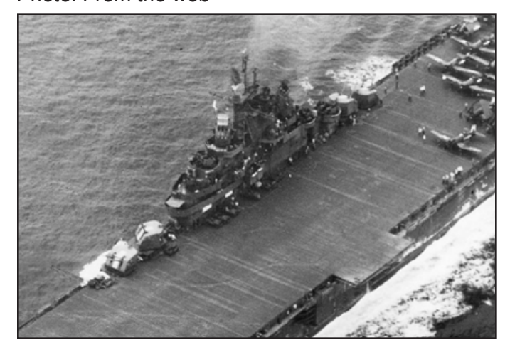
Essex in 1945

Using 3D printing, he has produced over 40 antiaircraft guns, (the Essex had 4 5"/38 double mounts, 4 5"/38 single mounts, 8 40mm Bofors quad mounts and 46 20mm Oerlikon mounts), side elevator, observation walks above the flight deck, and twenty five incredibly detailed aircraft models from Essex flight groups.